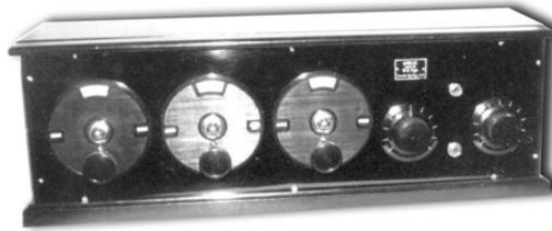
Pyle/Amplex - II, 1925

jacks are provided, one meant for use with a speaker and utilized the second A/F, while the other connects directly to the first A/F and is meant for use with earphones. While this is not an unusual feature in itself, the fact that both jacks provide a contact for completing the power circuit, eliminating the need for (and cost of) a power switch, is novel.